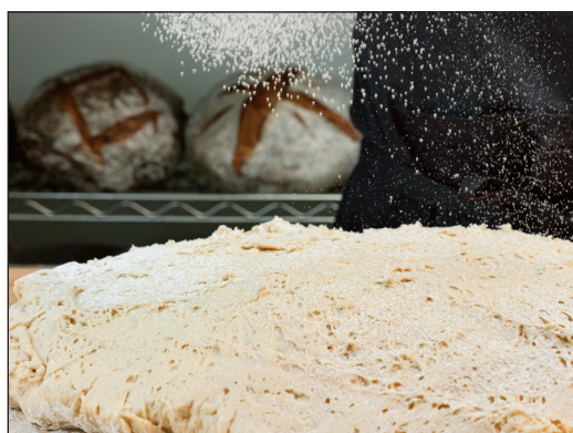
Direct Ciabatta (see page 4-162)