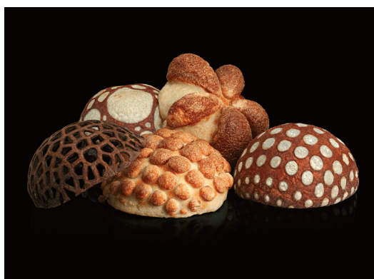
Balloon Bread (see page 5-140)