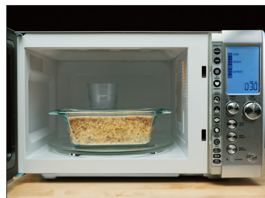
Microwave Whole-Grain Bread (see page 4-422)