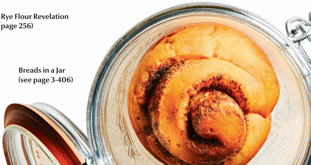
Breads in a Jar (see page 3-406)